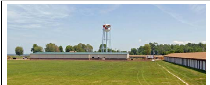
The 2009 USMC JROTC Air Rifle Championship will take place at the new Camp Perry, Ohio, Marksman Center that has an 80-firing-point range fully equipped with electronic targets.

Because of the short time period between when the USMC JROTC postal scores became final on 18Dec08 and the start of the Service Championship, it is critically important that every JROTC unit receiving an invitation to participate inform CMP as soon as possible as to your intention to participate. Instructors of qualifying unit teams or individuals are requested to complete a Team/Individual Entry Confirmation Form and return it to the CMP not later than Thursday, 15Jan09. Please use the form to notify the CMP that your unit or individual cadet will or will not participate in the Service Championship.